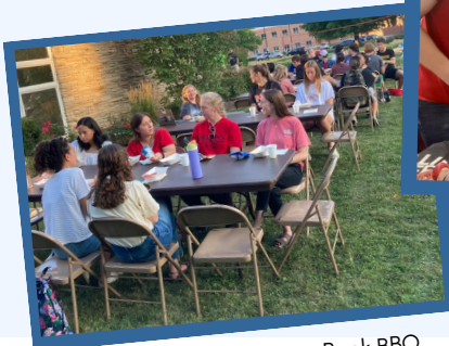
Students at the Welcome Back BBQ