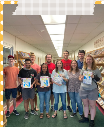
A FEW SMT MEMBERS AND MISSIONARIES GETTING READY TO CHALK ON CAMPUS