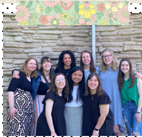
STUDENTS AFTER MASS