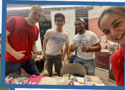
Students at a Pro-Life booth during the Sandwich Fair