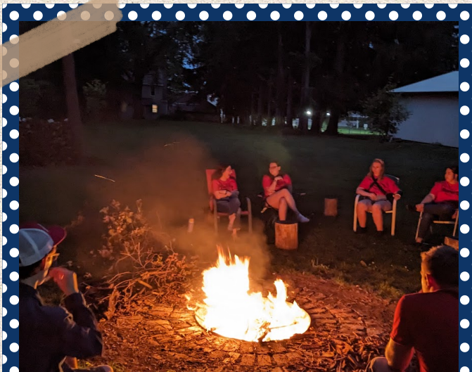
STUDNET MINISTRY TEAM BONFIRE