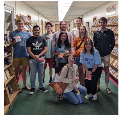
Students and missionaries getting ready to go on campus to tell people about Newman!