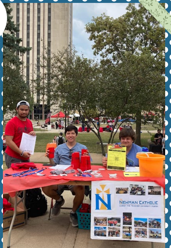
STUDENTS AT THE NIU INVOLVMENT FAIR